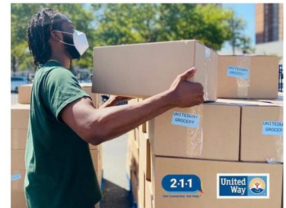
Preparing groceries for delivery.

Recognizing this food access challenge, United Way launched a new partnership with DoorDash, the nation's largest food delivery company, to create the Ride United Last Mile Delivery program and safely deliver food and critical household goods to high-risk and food insecure homes. Across 231 communities, United Way and 211, a vital service connecting people to essential health and human services, work with local food pantry partners to